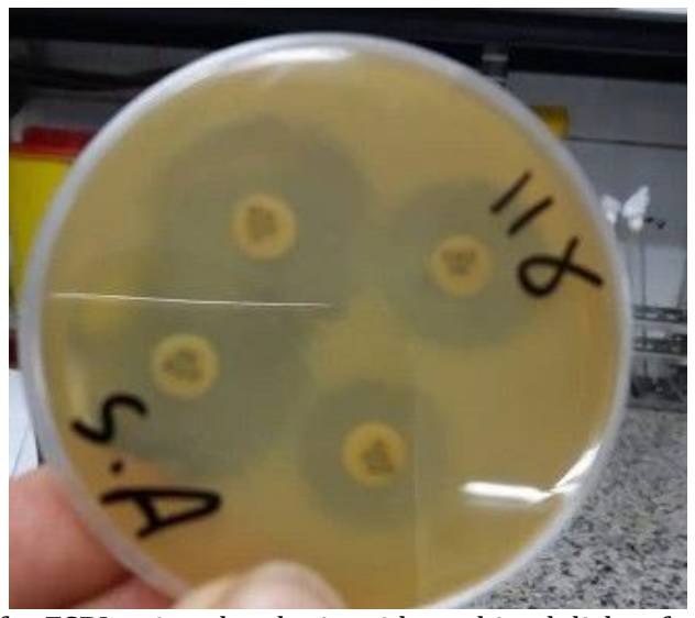
Fig. 1. Confirming test for ESBL using clavulanic acid-combined disks of ceftazidime (30 mg) and cefotaxim (30 mg).

harbored bla<sub>CTX-M</sub> gene (499 bp) which causes a high resistance against cefotaxime (Figure 2B). Additionally, similar tests revealed that 2 (4.9%) out of 41 beta-lactamase producing E. coli isolates harbored bla_{SHV} gene (471 bp) (Figure 3C).